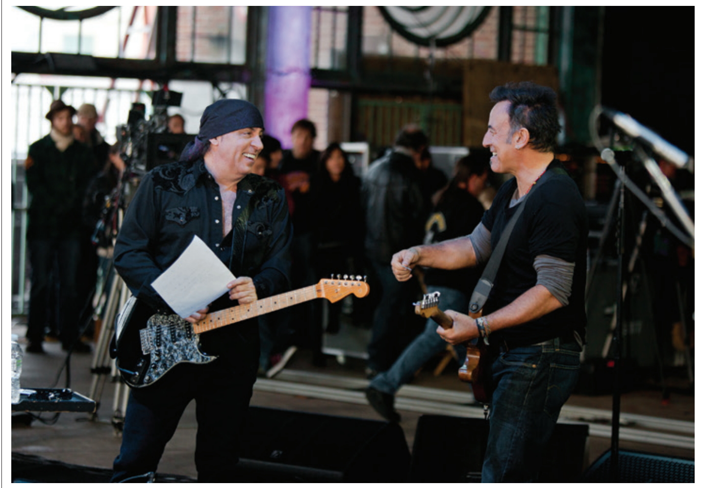
WINTER 2011/2012 BACKSTREETS PAGE 15

Around 4:00, the waiting crowd was led into the carousel house in small groups and positioned in various locations around the stage. Or the area serving as the stage-except for risers for Max, Roy, and the horns, the band was on the blackcanvas-covered floor in the center of the space, on the same level as the audience. Once the crowd was positioned to the satisfaction of the crew, the film shoot began with the '78 version of "Racing in the Street." Over the course of the next four hours, the band would perform ten songs from The Promise, each of which was performed in its entirety at least twice. In addition, Bruce frequently directed the band to reprise sections of songs in order to get endings, solos, transitions, and even lighting to the satisfaction of himself, Zimny, Landau, or a combination of the